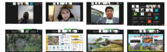
Online Pani Panchayat in Dhaula

GuruJal organized an online Pani Panchayat in Chandla Dugarwas in the presence of Asst. Vice President, Waste to Wealth Mission and Solid Waste Management Specialist, Earth Tree Organization. Gram Sachiv, members from Youth Group, SBM, SHGs, National Rural Livelihood Mission, Anganwadi, School Teachers and Chandla Dugarwas community participated in an extremely pertinent discussion about water conservation and ownership of the pond restoration work in progress at the village.