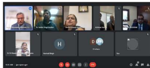
Meeting with Chairperson, Haryana Water Resources Authority