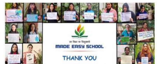
A glimpse from the webinar

The webinar was held titled आह्वान (Aahwahan) i.e., "a wakeup call" by MADE EASY SCHOOL, Bandhwari Gurugram in association with the GuruJal team to make students aware of the importance of water conservation and how they can do it. More than 150 students participated and presented the specifics about the Rainwater Harvest Systems, RWH pits in their school, various activities taken up in spreading awareness campaigns at their school, RWH systems at their homes, and related research work integrated into their curriculum. This was followed by an extensive information-packed session by the GuruJal team and a very interactive Q&A session.