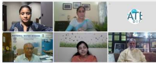
Round table discussion on “Catch the Rain” campaign