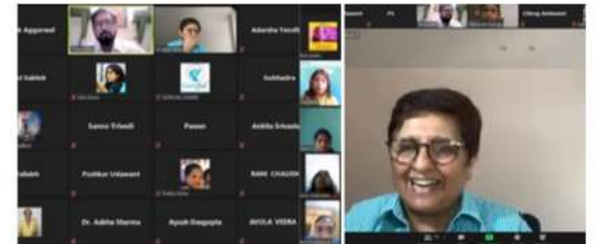
Water Awareness Session with Dr. Kiran Bedi

GuruJal in collaboration with Navjyoti India Foundation hosted a session on Water Awareness with Dr. Kiran Bedi (Water Warrior: Mission Water Rich Puducherry) on 1st May 2021. We received 370+ registrations and 350 + participants on zoom and Facebook live. This session was to make every citizen aware of our present water crisis and find solutions at individual level to Catch the Rain and Dr. Kiran Bedi Ma'am made it very interactive and insightful session by adding her perspective, guidance, and governance aspect to it.