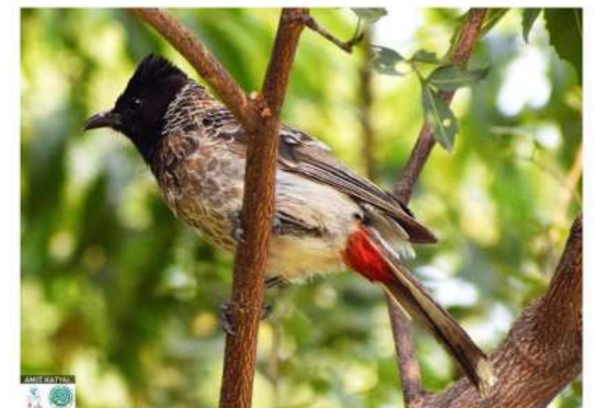
Red Vented Bulbul Photo by Amit Katyal during Nature Photography Walk