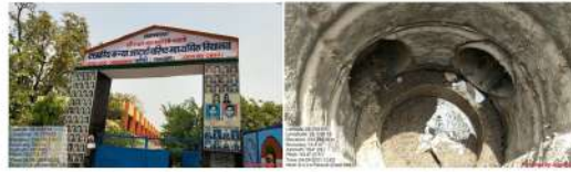
RWH functionality check at Govt. Girl Senior Sec. School, Pataudi