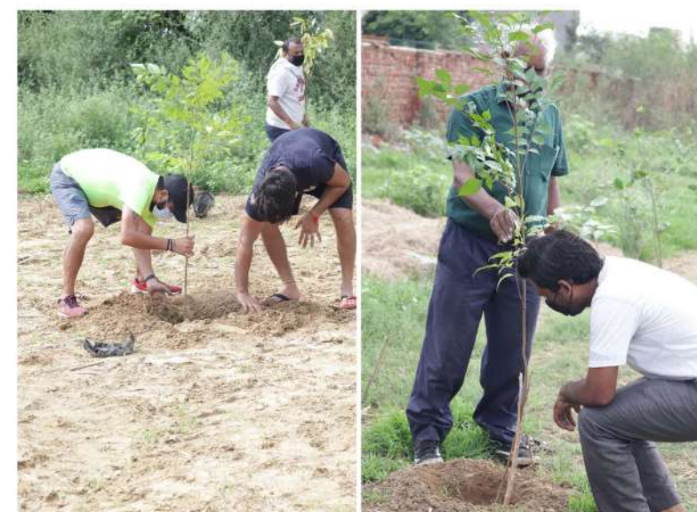
Plantation at Dhanwapur and Ullawas

Plantation drives were conducted in open areas provided by Municipal Corporation of Gurugram as a part of the urban plantation drive. Plantation in these areas was done by the volunteers who registered for the drive. The location of these open areas included Ajit Stadium Dhanwapur , Government Senior Secondary School Dhanwapur and Ullawas respectively. This drive was facilitated by GuruJal.