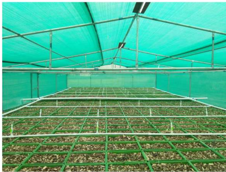
Wastewater treatment plant in Kasan

Pre-study report of Subhash Nagar site is complete.