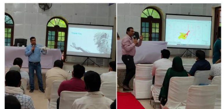
Glimpses from the DGPS and Drone Training session

Proposal of Jal Shakti museum has been submitted to the Ministry of Jal Shakti. The intention of creating a JAL SHAKTI SANGHRALAY is to create an embodiment of values and mission of create a Water Positive Environment. This will be done through designing and constructing the Museum and R&D centre according to LEED and IGBC Standards and being a house to premier research institutes and educational hub for propagating water positive policies and technologies in the country.