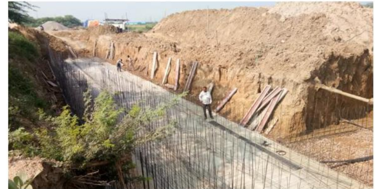
Dharampur-I construction site

Few site updates from GuruJal's on ground work this month include completion of pre feasibility check of two ponds, profiling of new MC ponds & construction work at Dharampur-I.